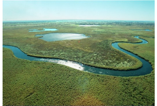
The Okavango Delta, river and wetlands from above.