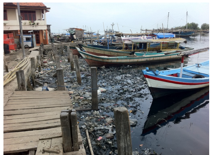
Pollution as a result of increasing population is one of the main issues in Jakarta Bay.

Through its REA, DHI set new standards for the management of development projects in Jakarta Bay. For the first time, clear, practical and concrete recommendations were provided on how to fix the problems and allow the majority of the proposed reclamations to proceed without causing conflicts or further negative impacts to the environment. The project has also led to additional SEAs in the region as well as significant interest from several developers in Indonesia. Thereby, DHI is improving environmental outcomes of coastal developments and building the capacity of local environmental regulators to properly manage the environment. Ultimately, this will improve the environmental condition of the Bay while at the same time improving the quality of life of the bay’s residents and allowing for key developments to continue.