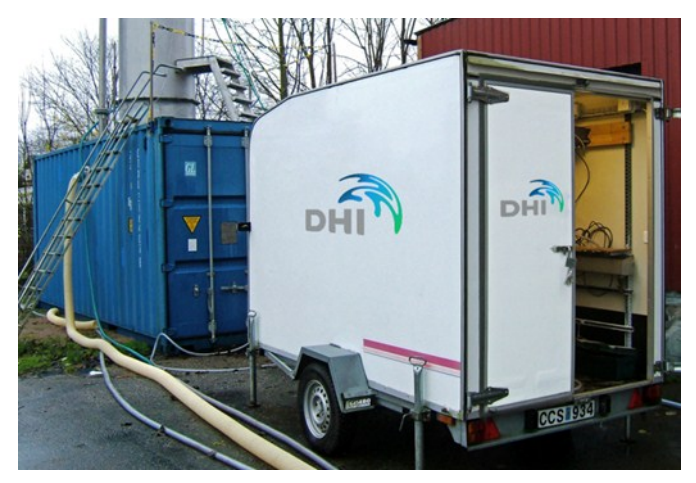
Trailer with online analytical equipment in the field