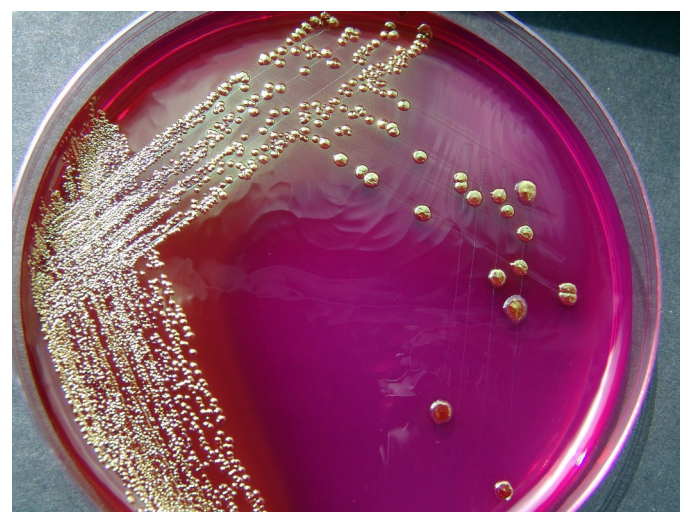
Microbial contamination often poses a public health risk

With the criteria for the process upgrade specified, the client has the best available foundation for pre-design of the process equipment and for formulating the technical specifications in the bidding documents. Specific criteria for the removal or inactivation of microorganisms over the procured treatment equipment help to ensure the supply of safe water in the future.