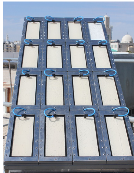
Photocatalytic membrane filtration pilot in Jordan

Using our expertise, we can help you develop and optimise your membrane technology as well as identify the membrane technology that best suits your needs.