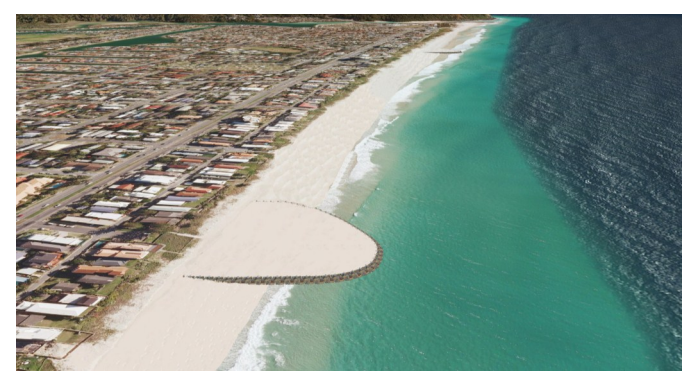
Palm Beach. Illustration of management scheme with two headlands. View towards north.

Several scenarios were investigated with 10 years of numerical shoreline modelling. The scenarios were compared by evaluating the remaining volume of nourished sediment. Regular maintenance nourishment was also considered in the study.