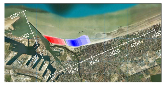
Example: Examination of beach nourishment at Dunkeque Port, France. Red colours indicate erosion.