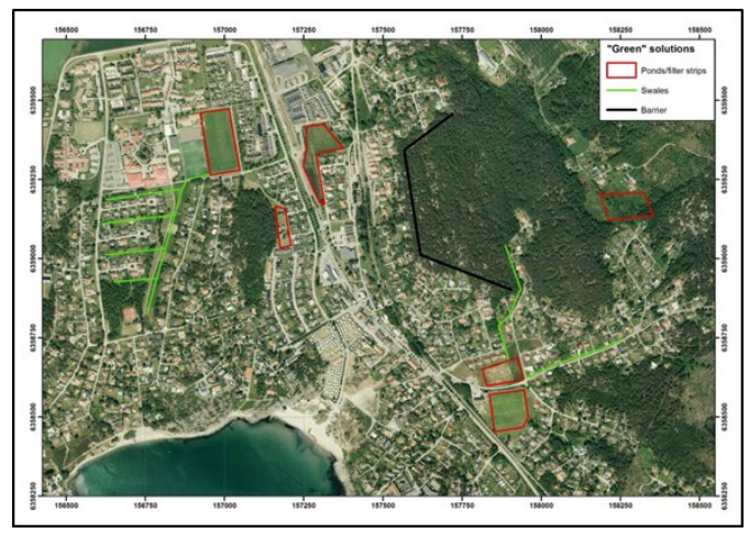
Example of SUDS

In new developments, the degrees of freedom are higher with regards to land use and elevation planning. In such cases, there is a higher possibility of making space for water. With our software and knowledge, different elevations and land use scenarios can be simulated in order to find the best possible ways to reduce the impact of heavy rain. Specific sustainable urban drainage solutions (SUDS) such as swales and retention ponds can also be simulated to investigate the flood-reducing effect.