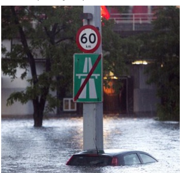
Flooding in Copenhagen 2011

Floods caused by extreme rain events are an increasing problem for cities worldwide. Increasingly dense urban developments, as well as a fast changing climate are stress factors which put intensify the issue of pluvial flooding. Climate change and extreme rain events are new topics on the urban planning agendas almost everywhere globally.