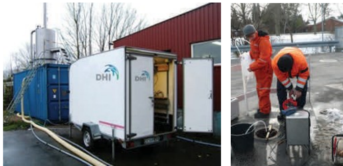
Verification testing on site