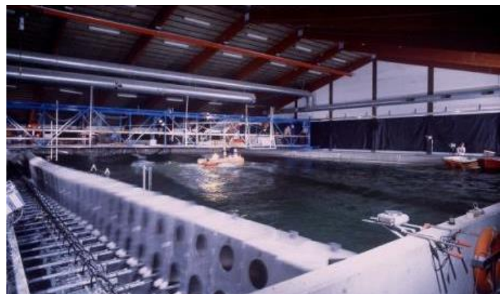
Figure 2: Testing an FPSO in DHI's Offshore Wave Basin

Wind load on vessels or structures can be simulated by computer-controller wind fans.