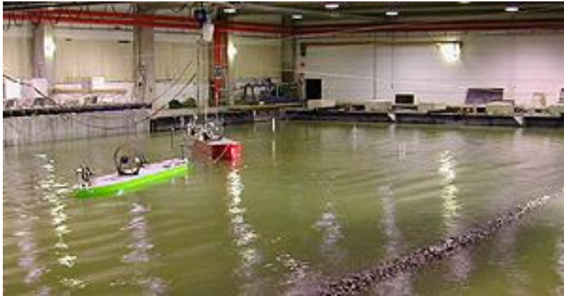
Figure 1: Testing of floating systems in DHI's Shallow Water Basin

DHI's Shallow Water Basin for combined waves and current is 35 m long and 25 m wide with an overall depth of 0.8 m. The basin is ideal for model testing when the effects of combined waves and current are of major importance, for instance scour around structures, and loads on fixed or floating coastal and offshore structures.