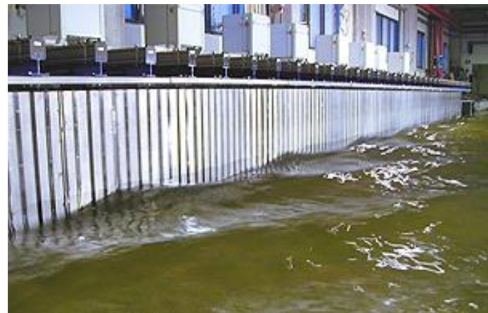
Figure 2: 3D wavemaker equipped with DHI AWACS Active Wave Absorption Control System

Furthermore, DHI's Shallow Water Basin provides the option of secondary uni-directional wave generation by movable piston type wavemakers.