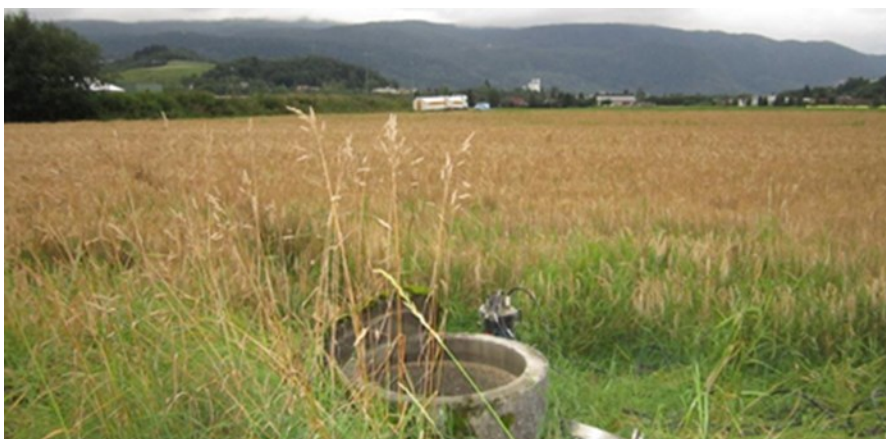
Flow meter installation in Trondheim, Norway