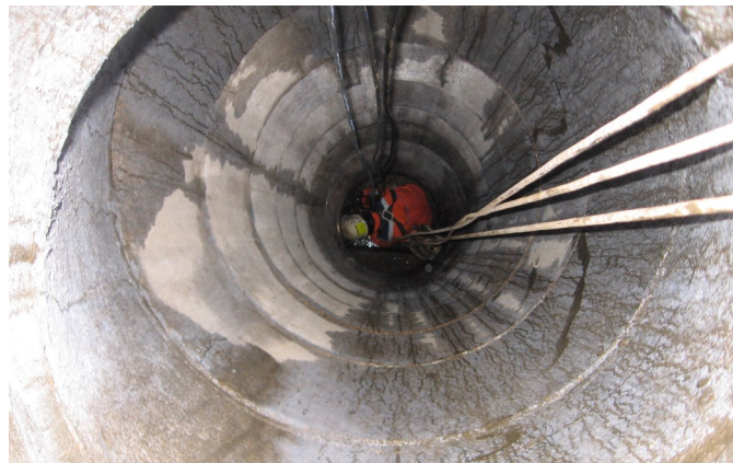
DHI employee installing a flow meter in Klippan, SE