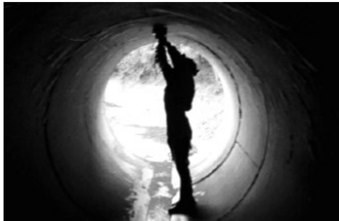
Storm water channel outline pipe at the Prague airport, CZ