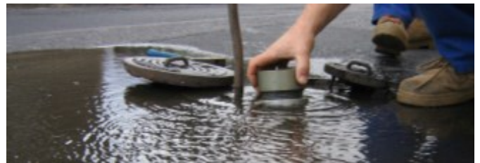
Pressure meter installation at hydrant in Teplice, CZ

Contact: Jessie Schroeck - jessie.schroeck@dhigroup.com or Milan Suchanek - milan.suchanek@dhigroup.com For more information visit: www.dhigroup.com