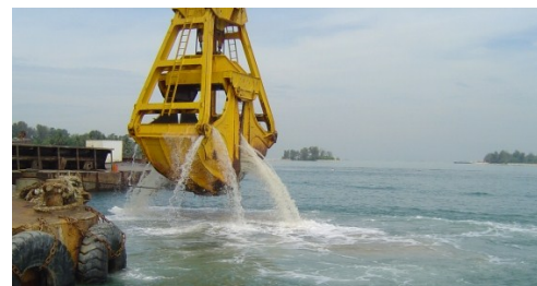
Rainbowing causes considerable sediment spill, while grab dredging results in less spill.

Contact: sedimentspill@dhi.com For more information visit: www.dhigroup.com