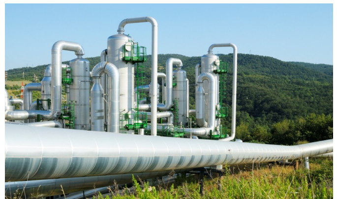
Many industries have to meet stricter environmental regulations and will have to invest to enable the required water savings.

We work towards cleaner production projects at all levels – from single production processes over complete factory solutions to symbiotic solutions at major industrial sites.