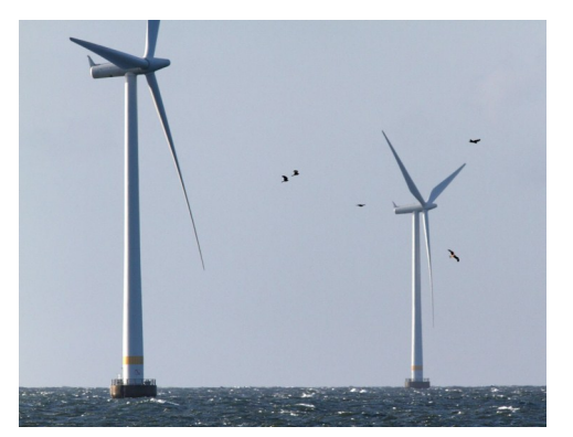
Red Kites passing wind farm

Our overall strategy involves targeted investigations of bird movements by the use of radar equipment, supplemented with our visual observations. We assess collision risks at the species level since general evaluations are inappropriate, owing to large differences in the size of affected populations . Combined radar, rangefinder and visual observations enable detailed statistics of the birds approaching and passing the wind farms. Generalisations can then be made and the number of collisions estimated using the species-specific collision models. Similarly, species-specific models of the barrier effect of a wind farm on bird movements can be developed.