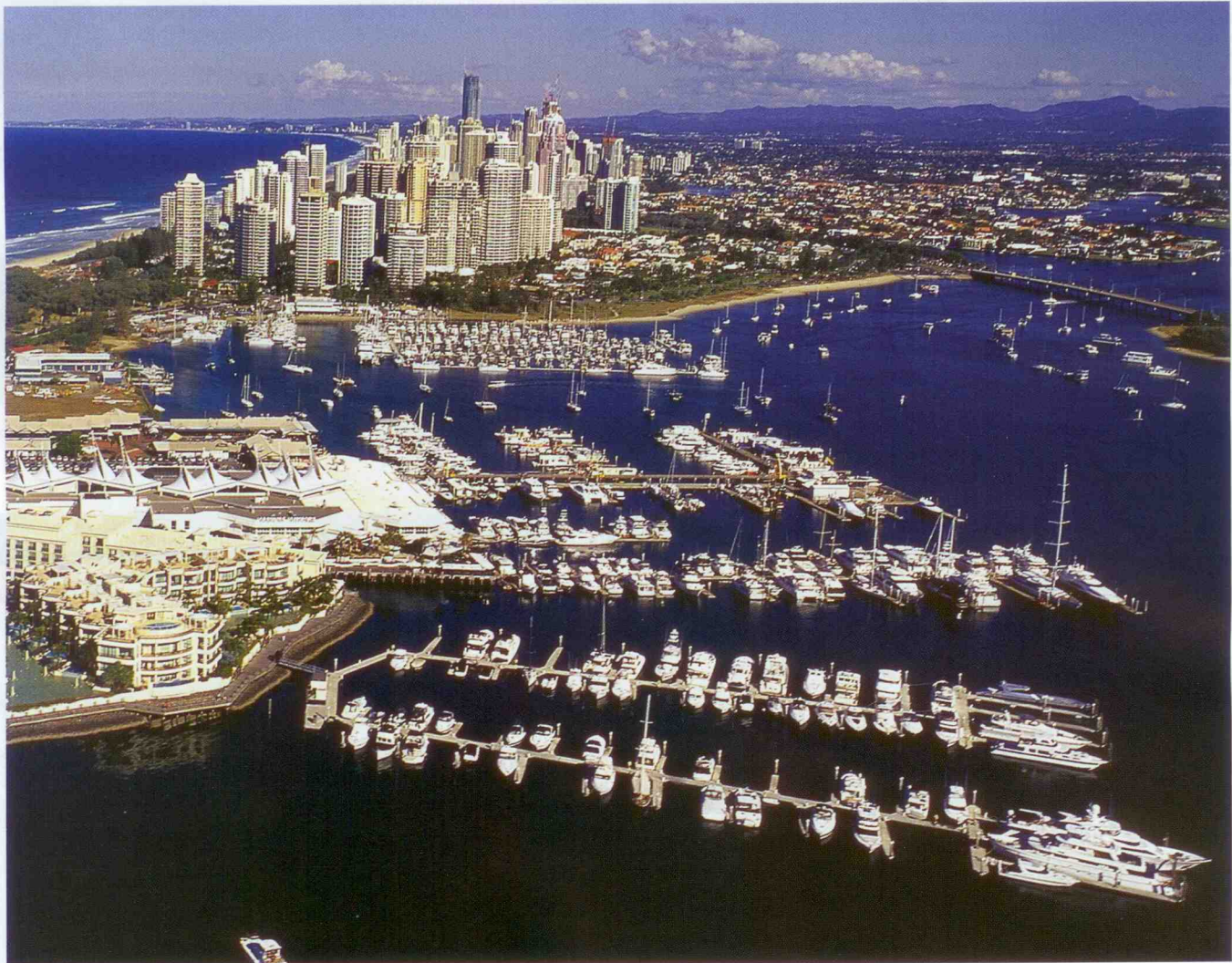
Flood forecasting software MIKE floodwatch will receive live inputs from the Bureau of Meteorology and Gold Coast City Council water level measurements to produce forecast models in flood emergency situations.

The unique capability of the system is the fully automated and self-correcting hydraulic model. During a flood emergency