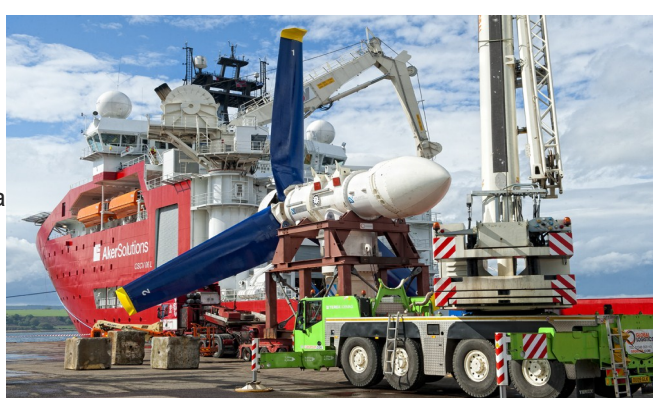
becoming increasingly Atlantis 1MW AR1000 turbine prior to installation for open ocean likely to succeed and testing at the European Marine Energy Centre (EMEC)

As such, the tidal energy sector is still in the pioneering phase. In comparison with conventional hydropower and wind energy, tidal power is a difficult resource to tap into and many uncertainties still surround successful tidal power generation. However, it is becoming increasingly likely to succeed and at DHI, we have an