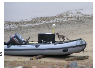
Development in the Arctic requires special environmental considerations due to the high sensitivity of the ecosystem.