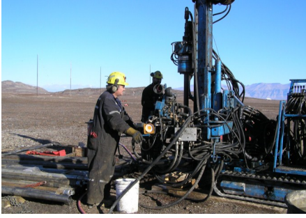
Arctic engineering is a challenge - for the structures as well as the personnel. We know how to deal with it.